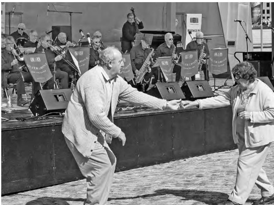
Silver Grove Swing Band, U3A Nunawading